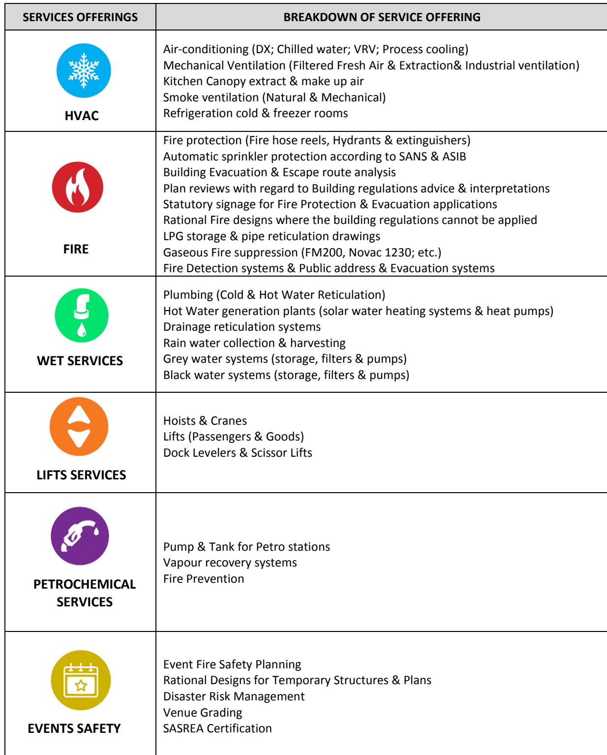
Table 1 - Below provides a summary of our Professional service offerings:

We are a BBBEE Level 1 company, and have professional indemnity insurance to the value of R10 million.